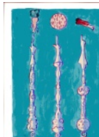
Pesach, Matzah, Maror