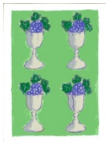
Fruit of the Vine