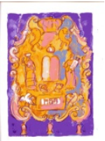
Pesach Torah Breastplate