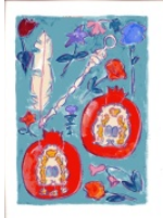
Israel's Fruits and Flowers