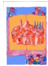
Next Year in Jerusalem