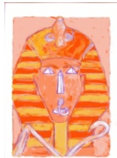
Pharaoh Who Knew Not Joseph